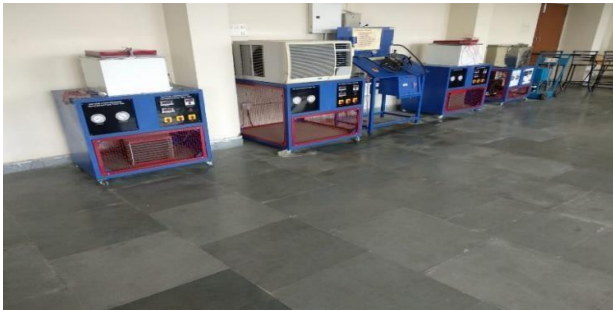
Refrigeration and Air Conditioning Lab