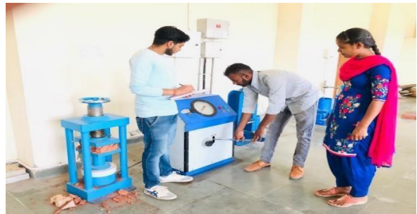
Concrete Technology Lab