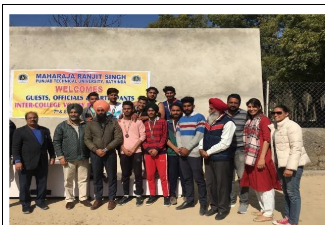
Won Bronze Medal in Volleyball Tournament