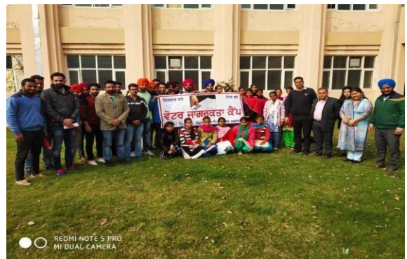
Voter awareness camp