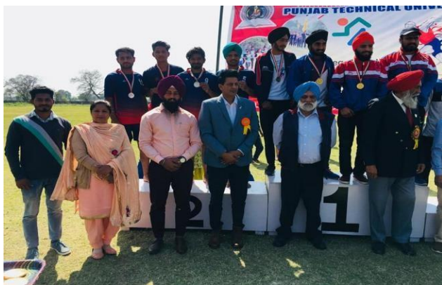
4 th Athletics Meet at MRSPTU