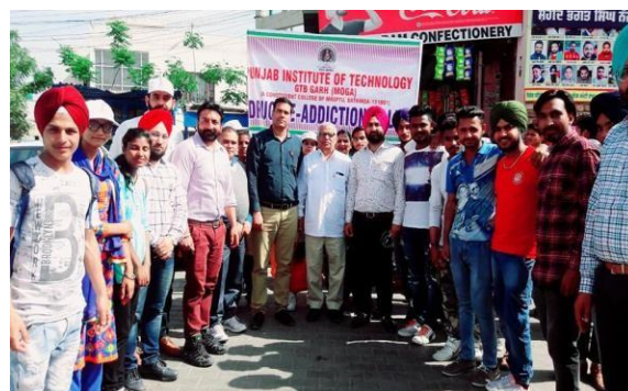
Drug De-Addiction Rally