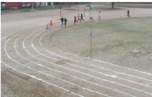
200 m Track