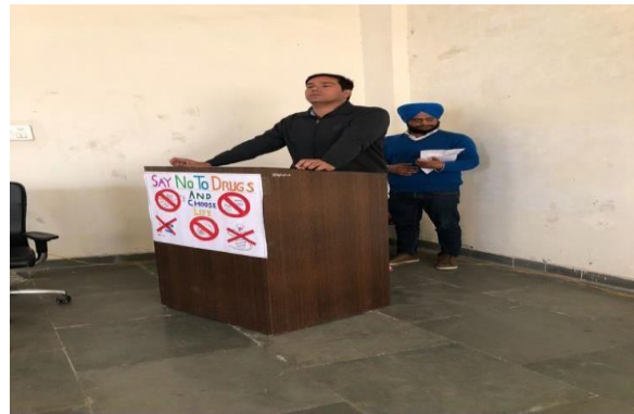
Anti drug abuse seminar