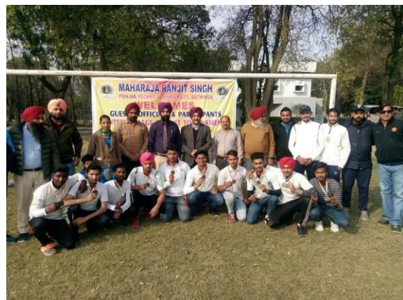
Won Bronze Medal in Cricket Tournament