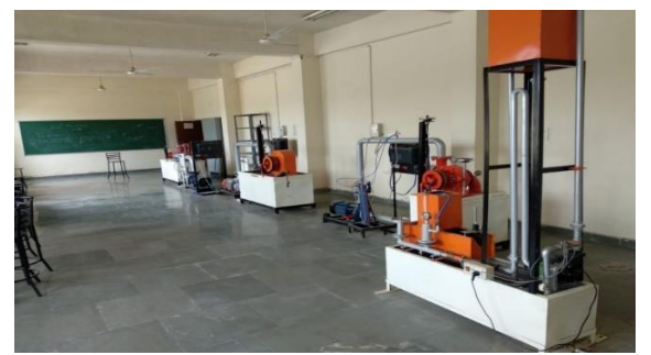
Fluid Machinery Lab