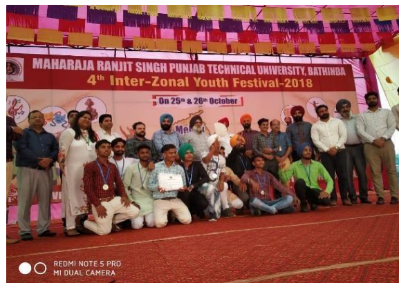
Won Bronze Medal in Youth Festival