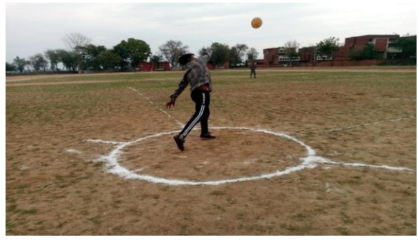
Discuss Throw Ground