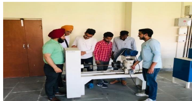
Strength of Material Lab